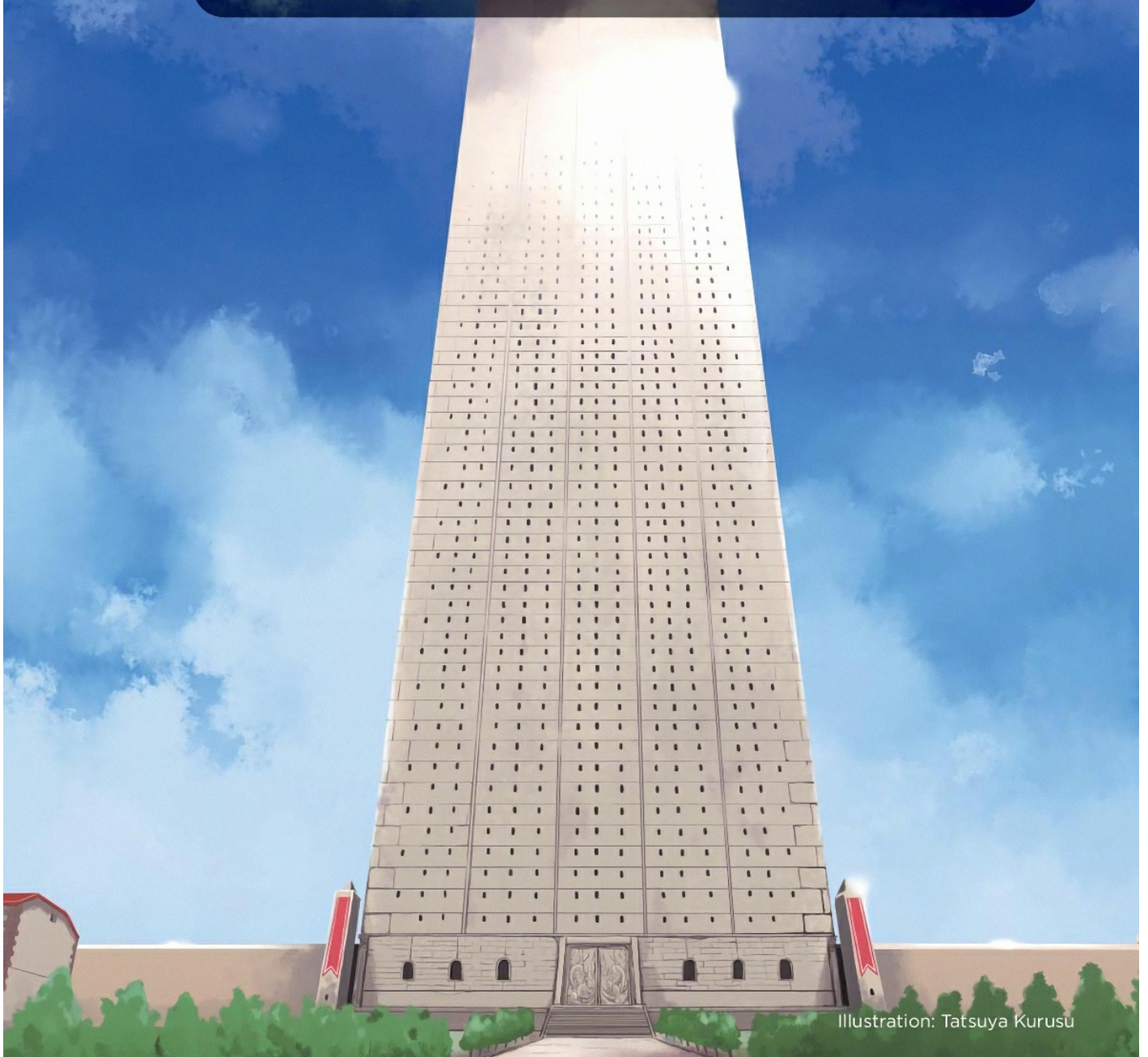
Illustration: Tatsuya Kurusu

The cathedral is one hundred floors in height, the top floor housing the chamber of the Axiom Church's pontifex. The middle floors are where the Church's administrative agents, such as monks and priests, manage the affairs of humanity. There is also an armory on the third floor and the Great Hall of Ghostly Light on the fiftieth floor.